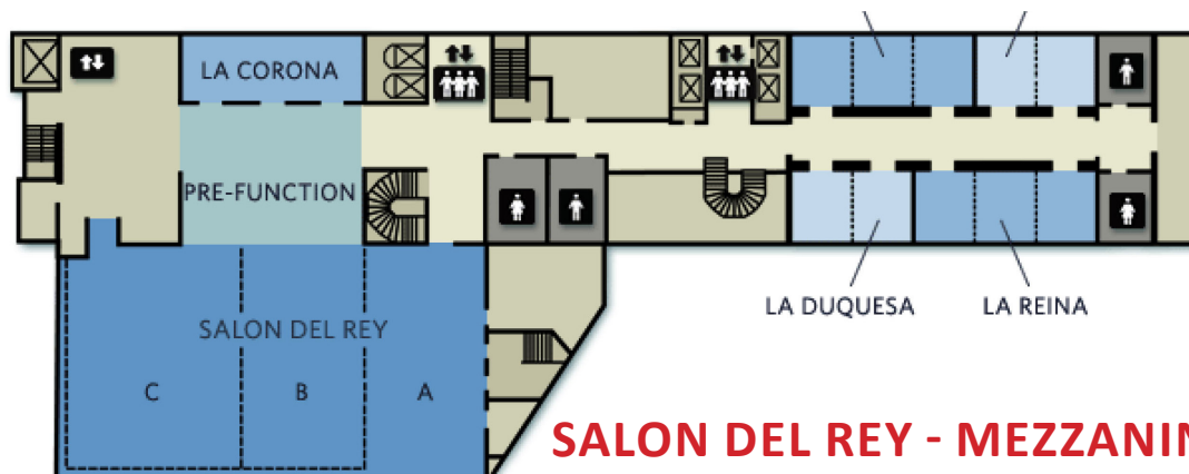
SALON DEL REY - MEZZANINE LEVEL