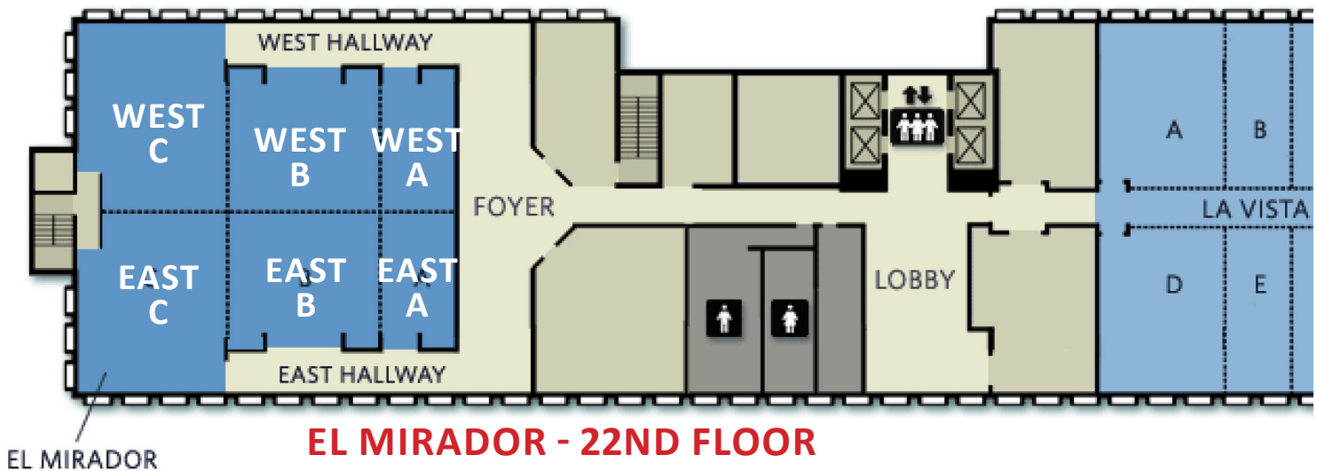
EL MIRADOR - 22ND FLOOR